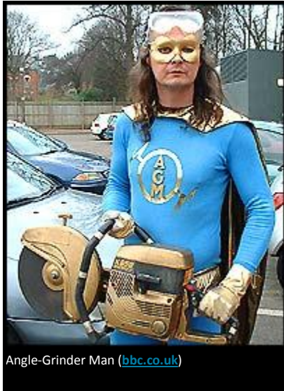
Angle-Grinder Man ( bbc.co.uk )