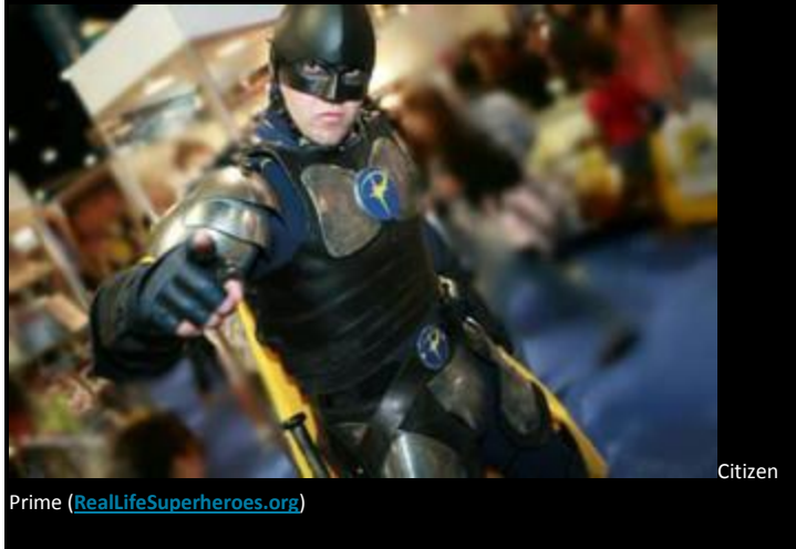
Prime ( RealLifeSuperheroes.org )