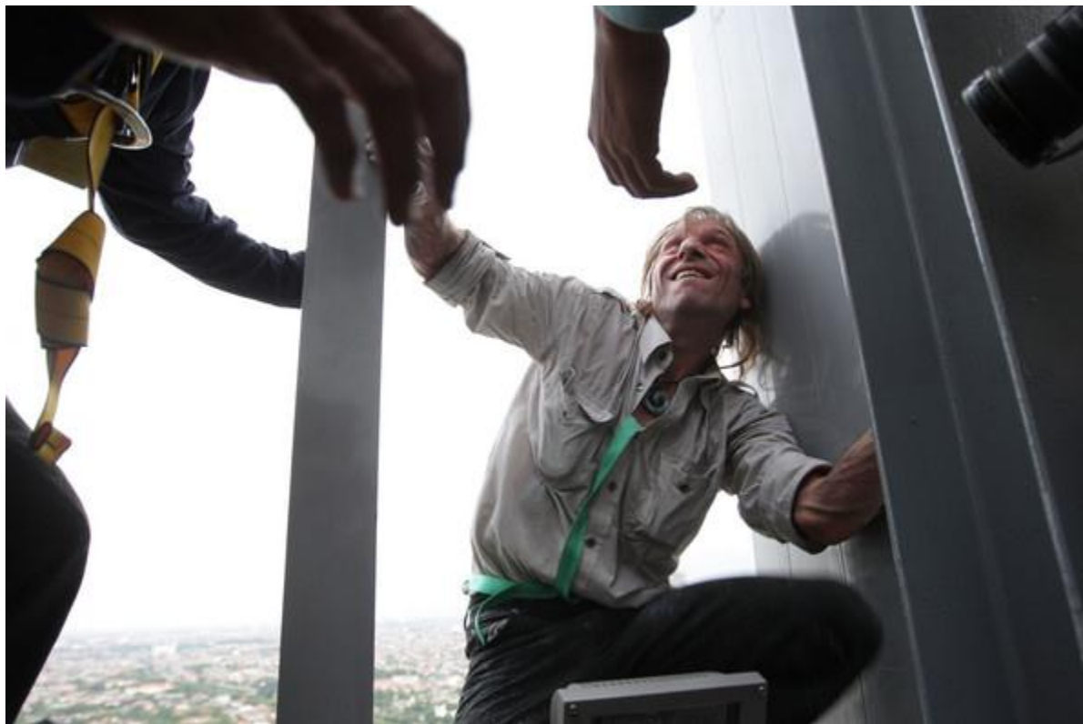
French rock and urban climber Alain Robert scales the City Tower on November 12, 2008 in Jakarta, Indonesia. more pics >