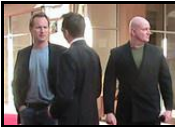
Patrick Wilson (left) played Nite Owl in Watchmen . Superhero (right) worked his security

"I don't really know when I made the transition, but just all of a sudden one day it seemed like a good idea to put on my costume and go out and help people with roadside assistance."